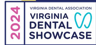
Exhibit booths will be assigned in accordance with the exhibitor's preference in the order in which completed agreements are received with the correct deposit. VDA cannot guarantee that booth space requested will be granted. Also taken into consideration are competing companies if noted on the application. Shielding cannot be guaranteed.