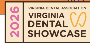
Exhibit booths will be assigned in accordance with the exhibitor's preference in the order in which completed agreements are received with the correct deposit. VDA cannot guarantee that booth space requested will be granted. Also taken into consideration are competing companies if noted on the application. Shielding cannot be guaranteed.